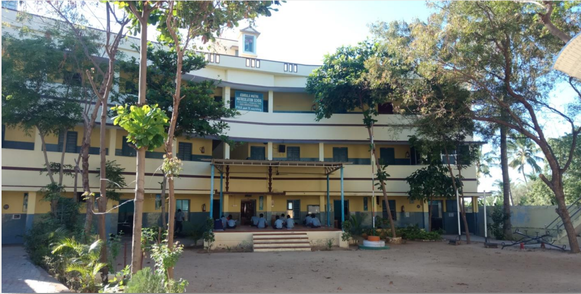
Front view of the school