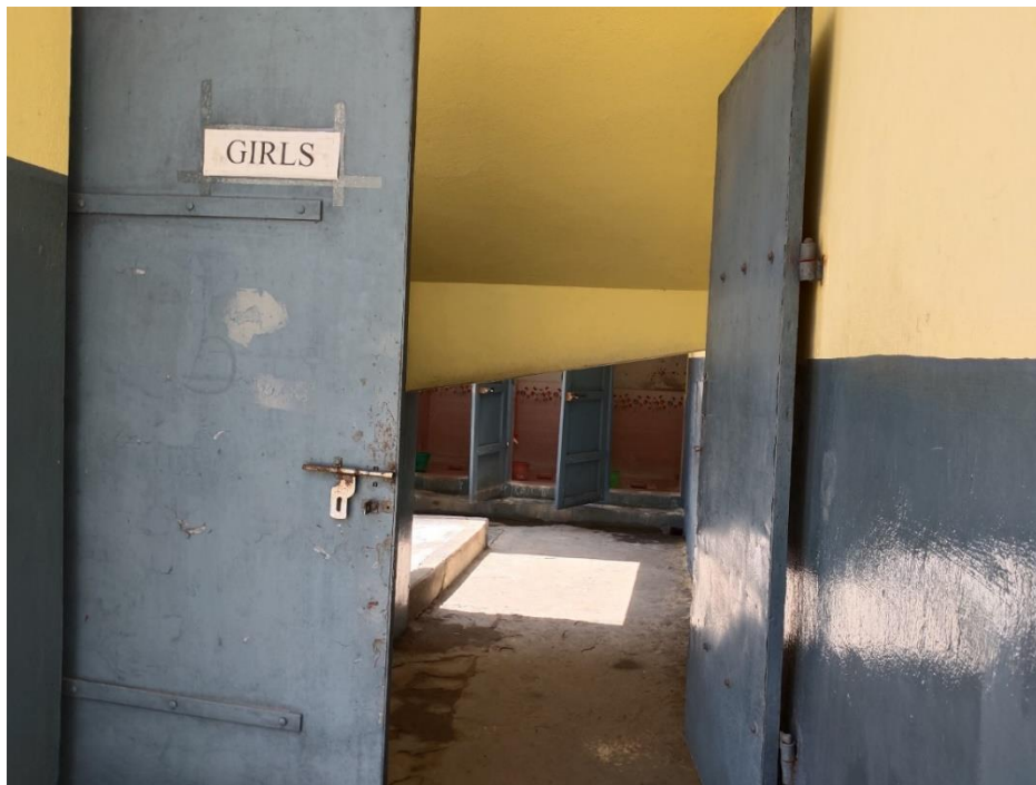
Current toilet block, girls