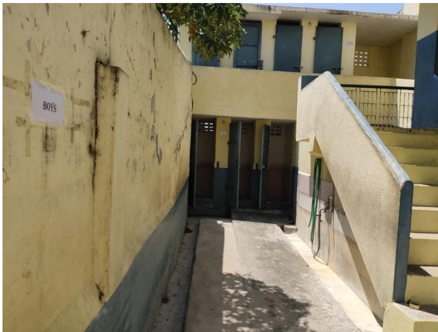
Current toilet block, boys